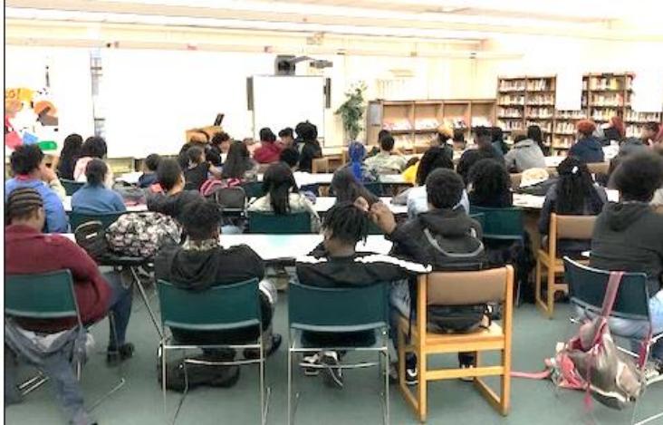
Teens gather to watch powerful curriculum videos from Choosing the Best, Journey series.

FYSB, ACF, USDHHS – CFDA #93.060 CJH Educational Grant Services, Inc. (CJH)